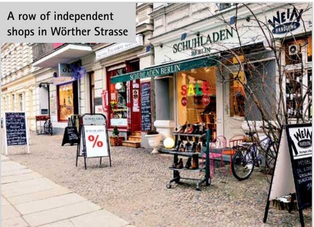
A row of independent shops in Wörther Strasse

If your business is an export/import business or you plan to do business abroad, we are also experts in international tax law, so we can advise you on all issues relating to cross-border trade, such as advising on cross-border taxation to enable the