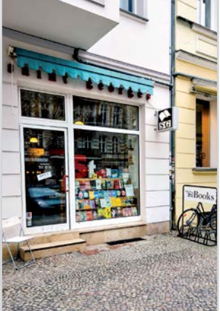
'An Englishman in Berlin': St George's Bookshop