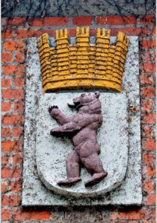
The bear features in the city's heraldic crest

We have successfully been advising clients for over 25 years. We have an array of clients ranging from private individuals to owner-managed businesses, from sole proprietors to SMEs. We are also an active member of Russell Bedford International, which is an international network of independent auditing, accountancy, tax consultancy and business advisory firms. Being an active member of the network has not only given us experience in servicing international clients but also a cultural sensibility that enables us to better understand their particular needs.