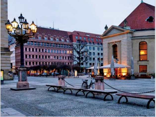
Gendarmenmarkt, the 'French' square

tax efficient repatriation of profits, reviewing double taxation treaties to eliminate the payment of withholding taxes, and issues relating to transfer pricing.