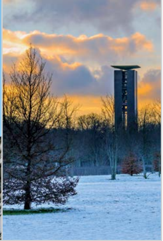
A view from the Reichstag

and file them with the appropriate authorities. We can also act as your representative with the tax authorities.